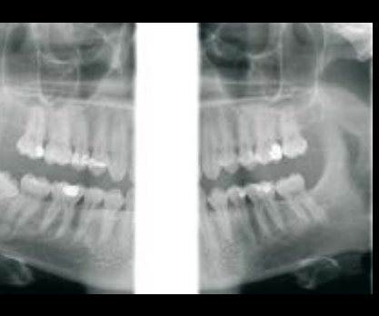
The bitewing view is a quick and easy alternative for intraoral bitewing imaging.